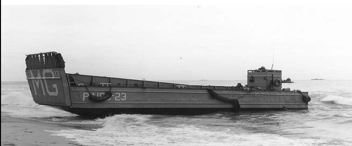
Photo # USN 1054472 LCM-6 from USS Magoffin beaches during Exercise "Pony Express", May 1961